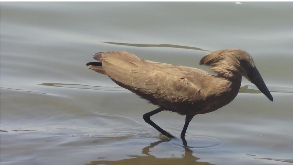
Plate 1. A hamerkop searching for prey at site 3.