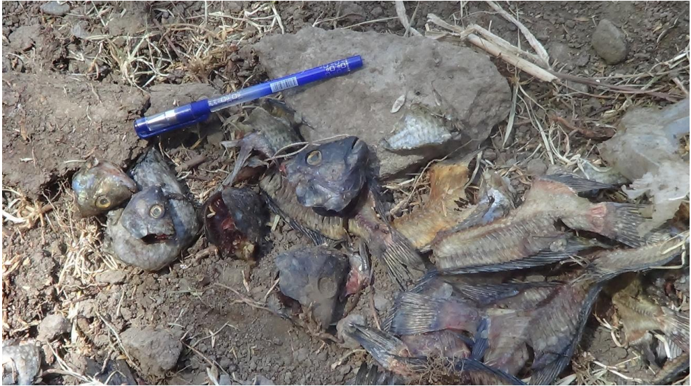
Plate 2. Fish scraps discarded by fishermen at site 2.

On average, the time taken by birds to swallow discarded fish scraps (head parts) is less than a minute which accounted for 53.3%, between one and two minutes (36.7%) and above two minutes (10%) (Table 3).