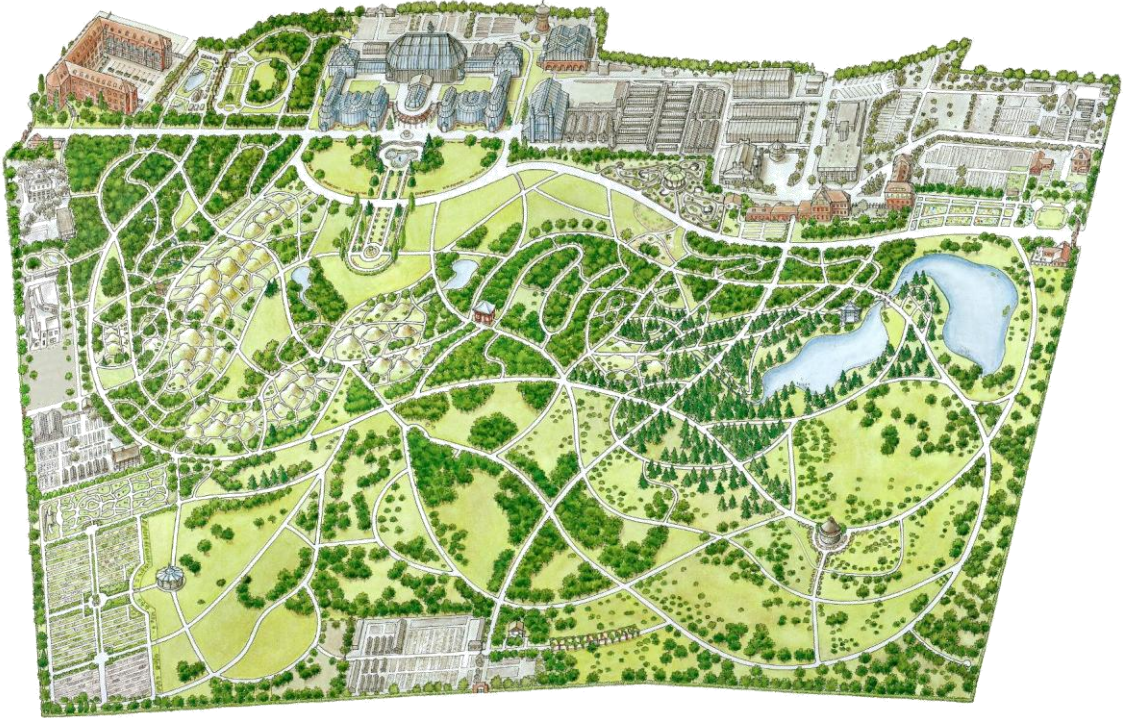
Fig. 1. Map of the Botanic Garden and Botanical Museum Berlin-Dahlem, which covers an area of 43 hectares. The garden's design follows the central theme "The world in a garden" and thus, its outside area is subdivided into a large plant geographical section, a system of woody plants (arboretum) and a number of smaller sections (e.g., the system of herbs, the medicinal plants garden and ornamental sections such as the 'Italian Garden'). The phytogeographical theme is pursued also in the public green houses. A phytogeographical approach - "The World in a Garden".

where plants are shown in systematic order (Fig. 1). The Berlin example also shows that a scientifically designed botanic garden can be at the same time very ornamental, thereby attracting a large number of visitors (in Berlin currently over 300,000 per year).