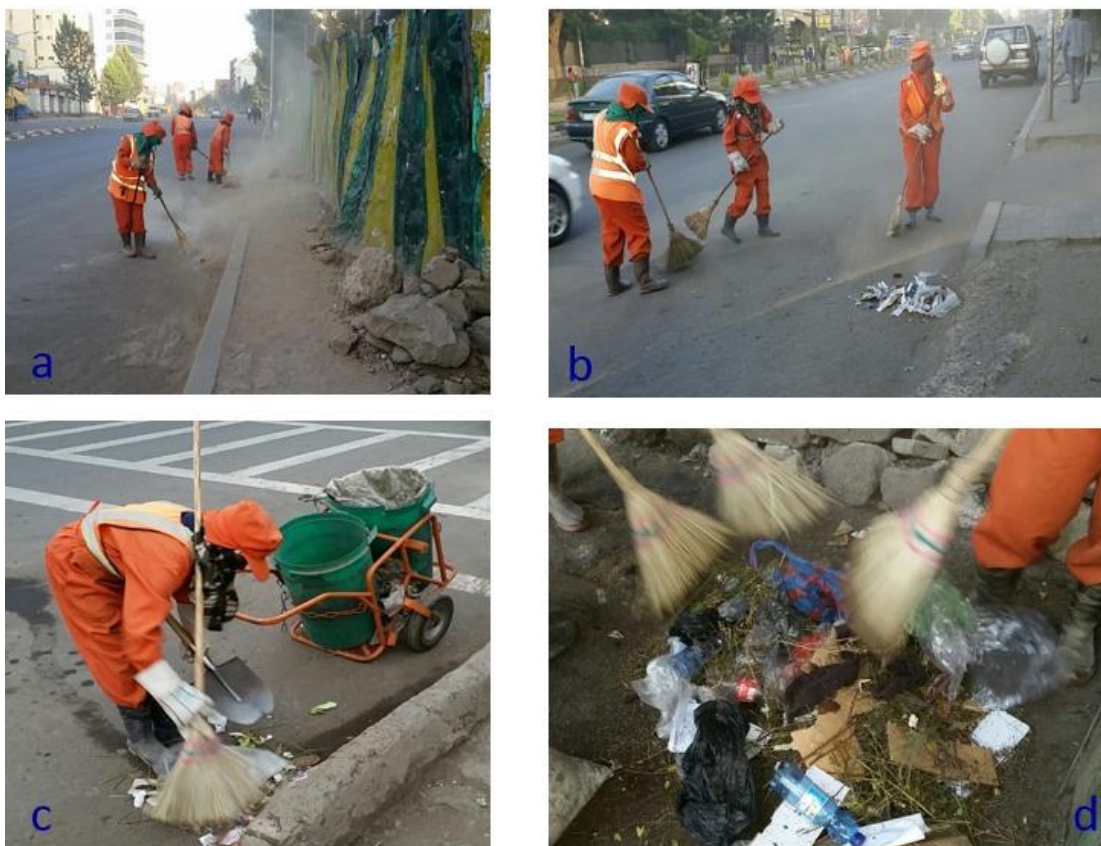
Figure 3: Street sweeping: a-Sweeping; b-collecting; c-dumping litters into dust bin; d-Sorting litters, Nov 2016

The exposure to dust presumably depended on the time covered and the intensity of sweeping. The first km had much sweeping and heavy dust plumes, as the sides are routinely busy with accommodating taxis and road-side businesses such as street food selling and many other nameless petty things. These activities are known to involve massive human movements which leave themselves things like litter, dirt, papers, plastic bags, leaves and straws of khat , used mobile phone cards, card boards, and debris (Figure 3).