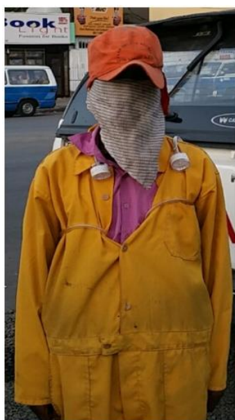
Front side arrangement

Data collection and measurement: The study was conducted from 22 nd -25 th November, 2016 in Addis Ababa (i. e, for 4 days, 5 samples per day). Personal total dust was sampled in the breathing zones (about 30cm from the workers nose) using a 37mm diameter of Millipore plastic sampling cassette fitted with polyvinyl carbonated (PVC) filters of 5µm pore size connected to Side Kick Casella (SKC) pumps operating at 2l/min (Figure 2). The position of the sampling head was on both sides (left and right), having each 50% of the sampling duration with the purpose of getting about equal measurements in both sides. The position of the neck (hence breathing position) is expected to adjust the flow of the swept dust in air.