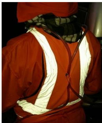
Back side arrangement