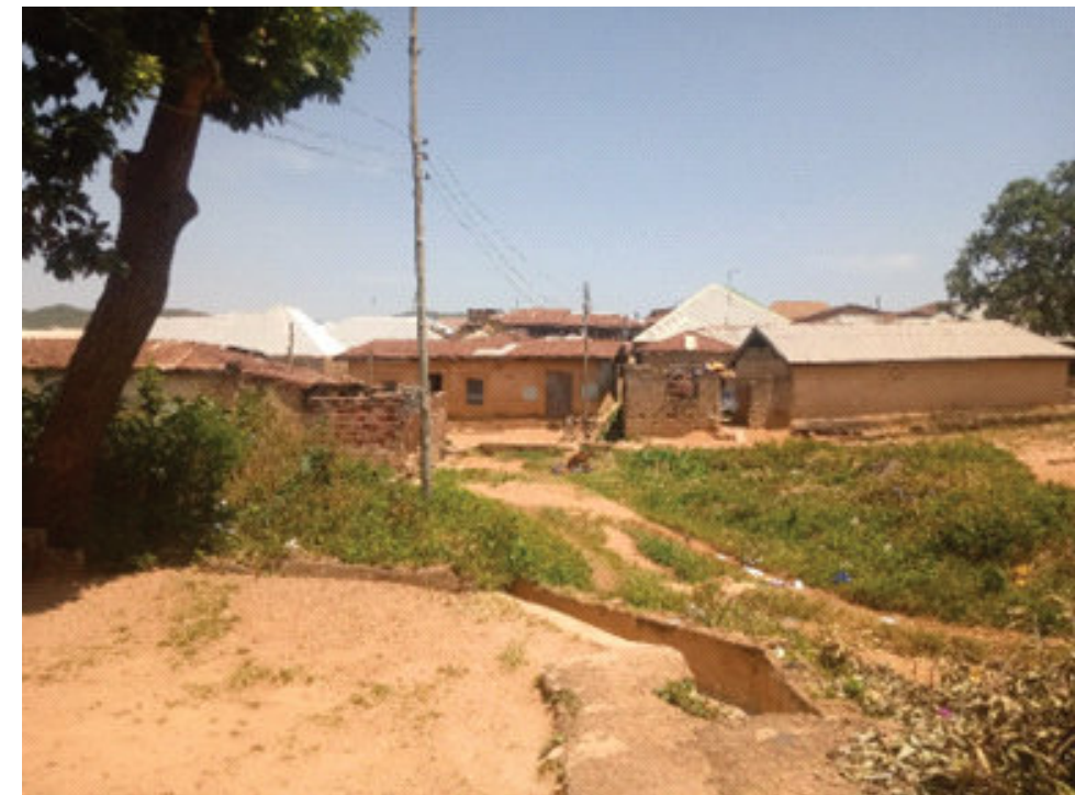
Figure 4: Spacing within Residential Areas

Most of the buildings in the study area are found to be congested as shown in Figure 4. Spacing within and around the residential areas is very tight as can be seen in the Figure. This suggests that the physical environmental setting of the neighborhoods will not enhance the enforcement of social distancing as non-pharmaceutical protocols for the prevention of COVID-19.