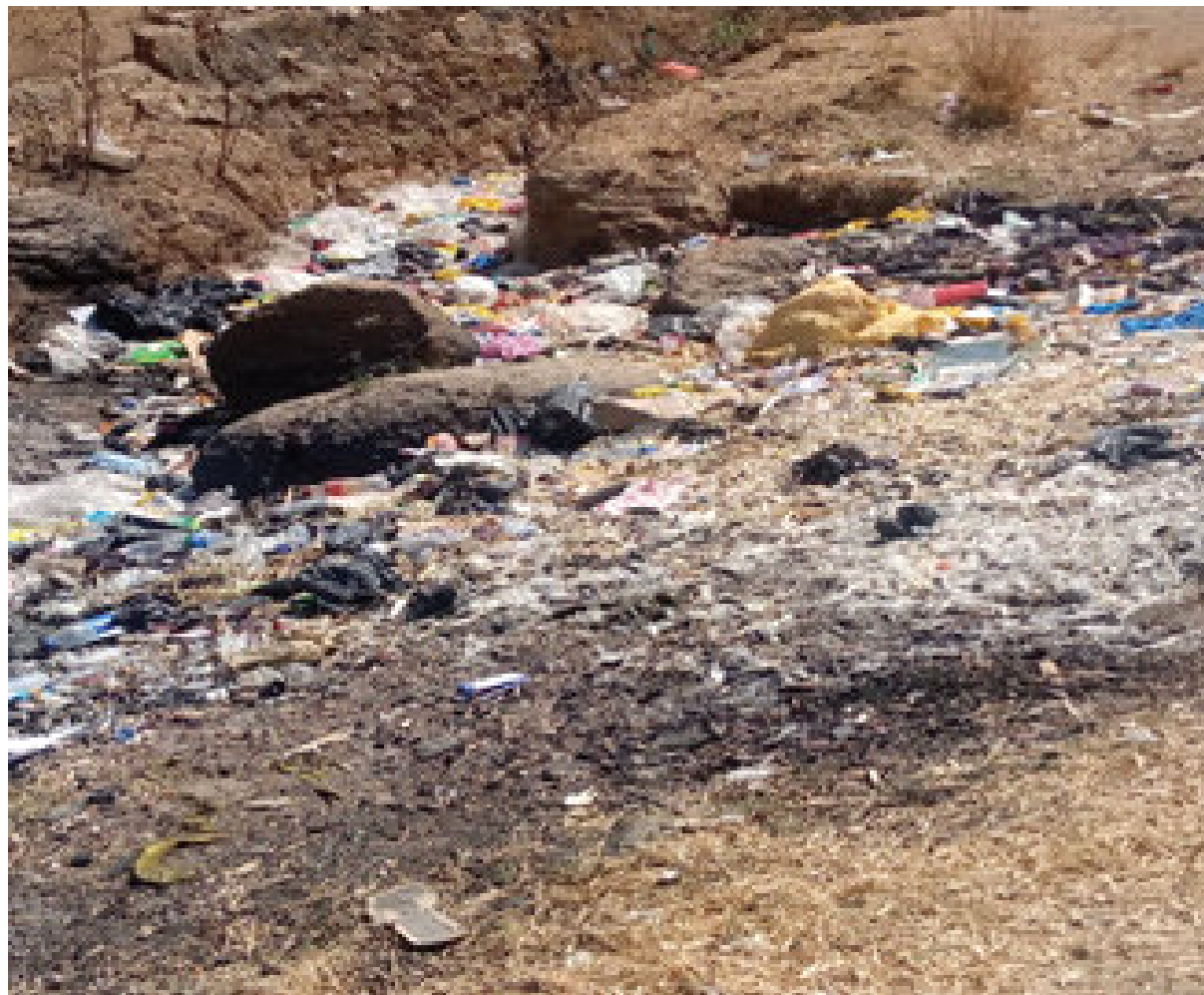
Figure 3: Non-designated Open Dumping Site

Table 5 shows the statistics on the method of waste disposal in the study area. The result indicates that over 50% of the households dump their domestic waste into streams and rivers followed by those who practice open dumping while few others burn their waste. These practices have cumulative negative effects on the people and the environment.