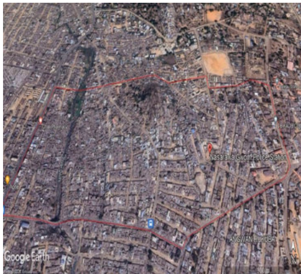
Figure 2: Settlement Pattern of the Study Area

Several physical attributes of the settlement pattern of the study area were examined in the context of the spread of the COVID-19 pandemic. This was done to determine the adaptability of the settlements to the non-pharmaceutical protocols to COVID-19. The attributes examined include settlement pattern, nature of congestion and availability of basic urban facilities amongst others.